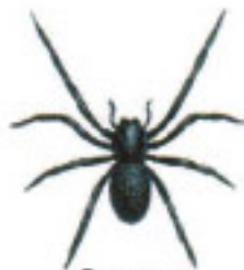
Common Black House Spider

Found in rock walls, tree trunks and crevices s.a. window frames, guttering, webs untidy with funnel like entrance