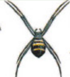
Saint Andrew's Cross

They're only a nuisance spider. Thick webs in the garden, beneficial.